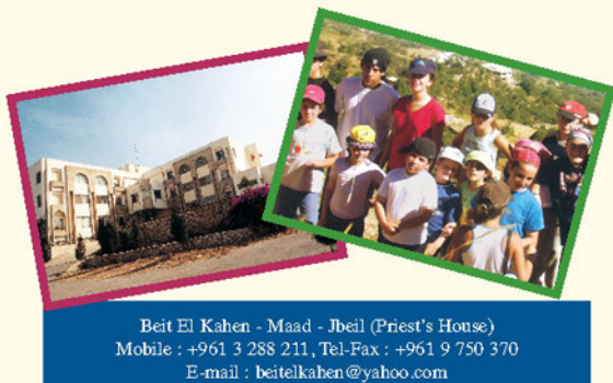
Beit El Kahen - Maad - Jbeil (Priest's House) Mobile : +961 3 288 211, Tel-Fax : +961 9 750 370 E-mail : beitelkafen@yahoo.com

Private room 15$ - dorm 12$ - lunch 5$ - dinner 5$