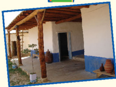
Taanayel Ecodge, Youth Hostel Tel: +961 8 544 881, +961 1 495 561 Fax: +961 1 512 107 Email: auberge@arcenciel.org www.arcenciel.org